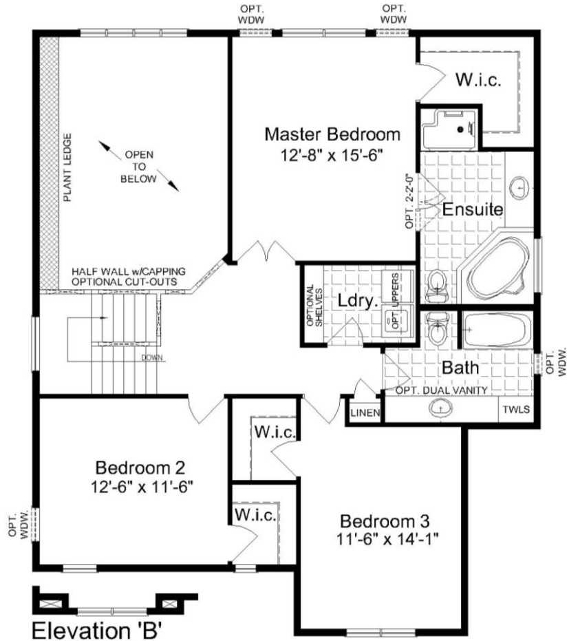
Upper Floor Plan ~ 1093 Sq. ft.

Actual plan may vary from brochure. This plan is published by Hilton Homes. Dimensions and square footage shown are approximate and subject to change without notice. Elevations may show optional features for artistic purposes. Please ask your sales representative for more information.