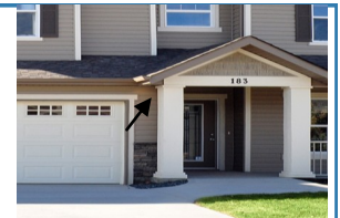
No Step Entry

VisitAbility defines a minimum level of accessible housing so these features are required starting points for the next section of this guide