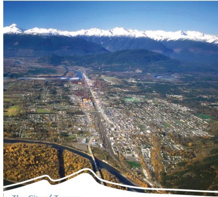
The City of Terrace Official Community Plan Schedule A